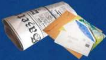
PAPER (MIXED & OFFICE) PAPEL (MEXCLADO Y DE OFICINA)