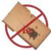
PIZZA BOXES CAJAS PARA PIZZA