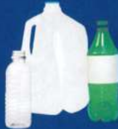
HARD PLASTICS PLÁSTICOS RÍGIDOS