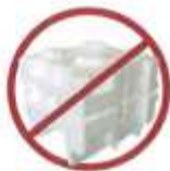
STYROFOAM POLIESTIRENO EXPANDIDO