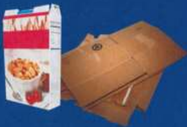
FLATTENED CARDBOARD CARTÓN APLANADO