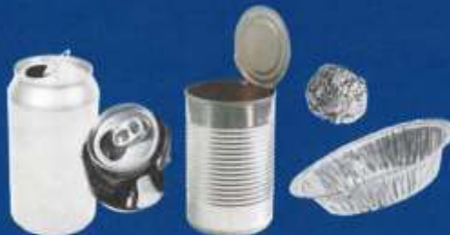
ALUMINUM & STEEL CANS & FOIL LATAS DE ALUMINIO Y PAPEL DE ALUMINIO