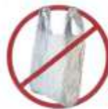
PLASTIC BAGS BOLSAS DE PLÁSTICO