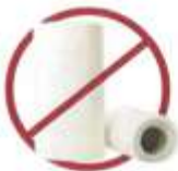
PAPER TOWELS TOALLAS DE PAPEL