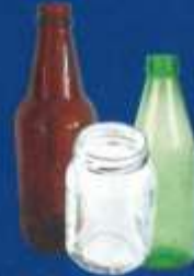
GLASS BOTTLES & JARS VIDRIO (JARROS Y BOTELLAS)